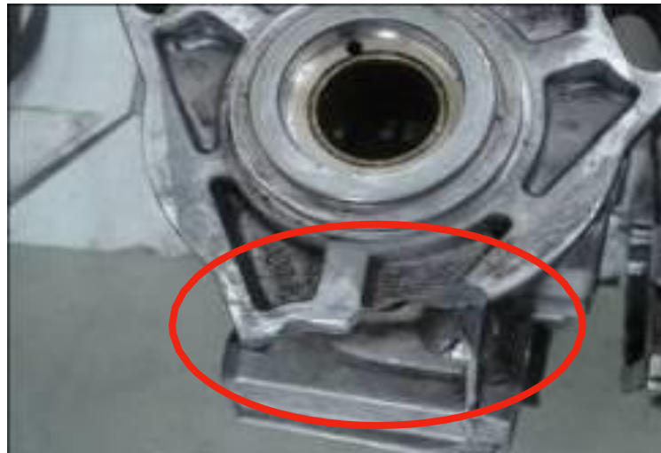
Damage To Housing