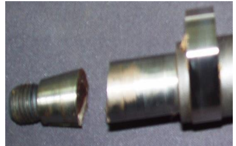
Damage To Shaft