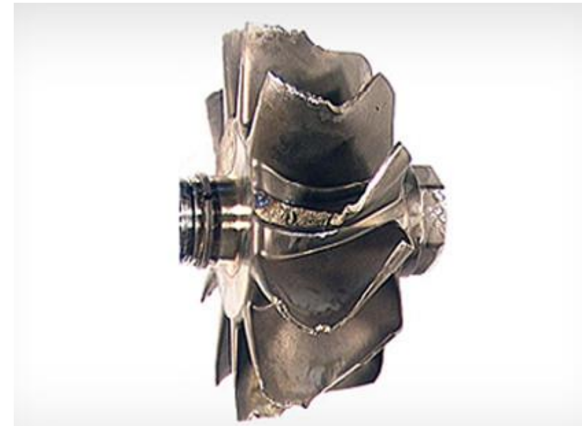
Large Particles Can Cause Deep Scoring And Impacts