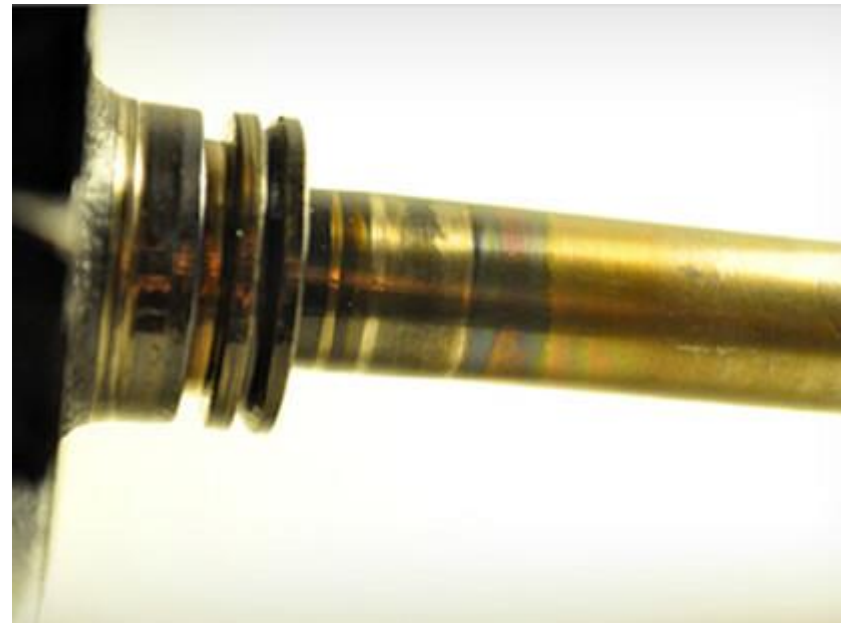
High Temperature And Material Transfer From Bearing