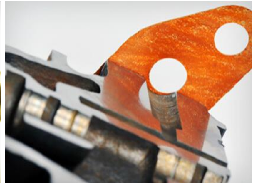
Incorrect Shape And Position Of Gasket