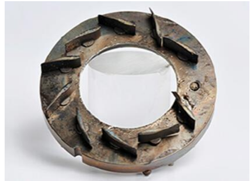
Damage To A Nozzle Assembly