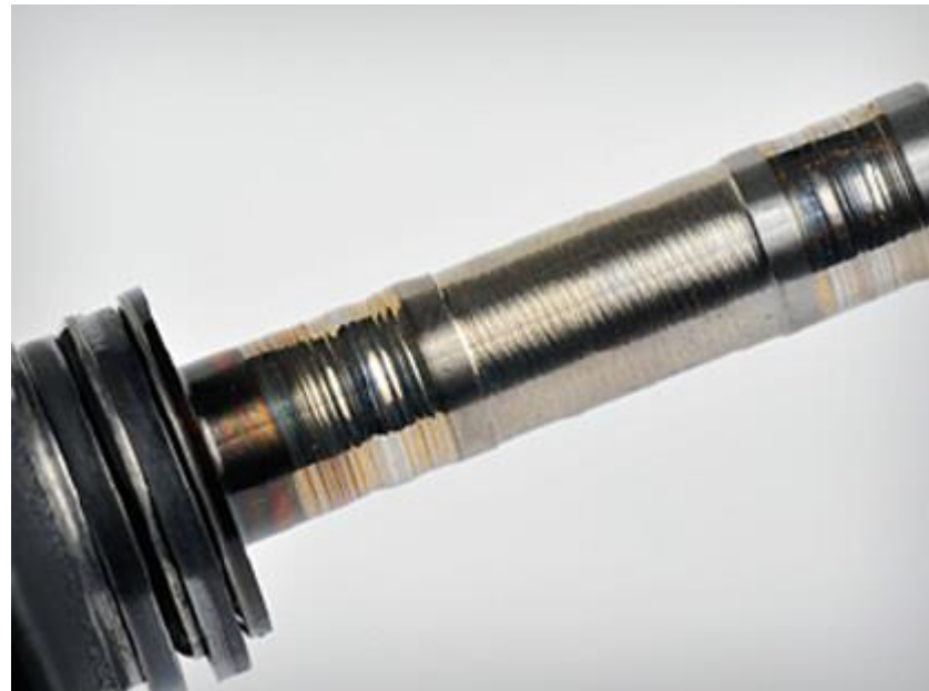
Worn And Scored Bearing. Material Transfer To The Shaft