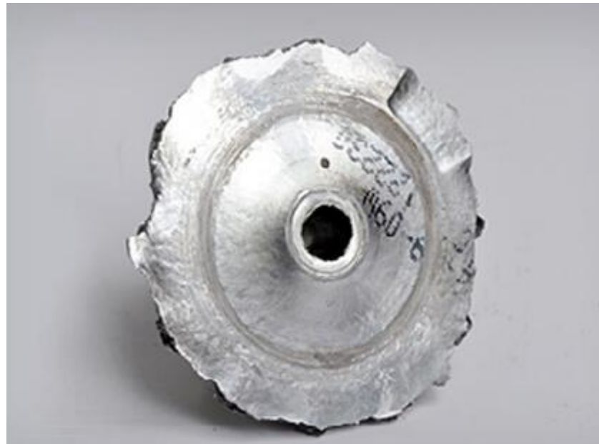
Orange Peel Effect On Back Face Of Compressor Wheel Is A Clear Sign Of Over Speeding