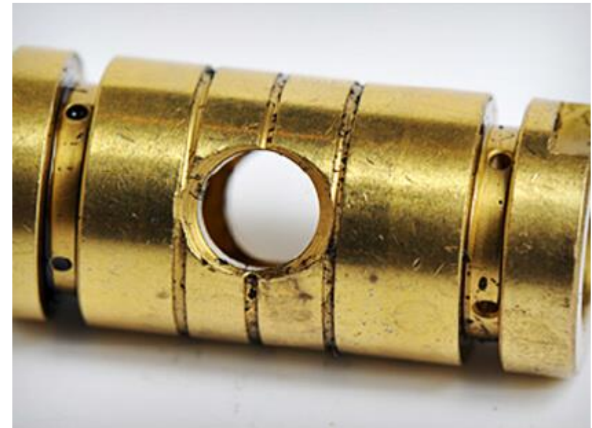
Large Particles In Oil Can Cause Deep Scoring And Impacts